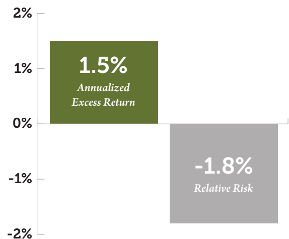
FIGURE 1 U.S. Large Cap Stocks: Firms with greater gender diversity outperformed with less risk